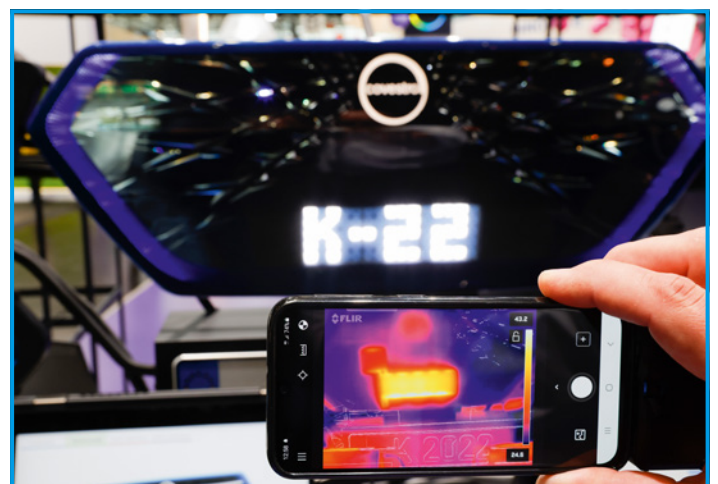
Integrated heating ensures reliable radar sensor function and display performance in harsh weather.

This requirement touches a wide range of thermoplastics, coatings, and other raw materials used for lighting components. Now it becomes potentially relevant to many new exterior body part concepts . Covestro answers the call for AMECA compliant materials with our Makrofol® and Makrolon® polycarbonate portfolios.