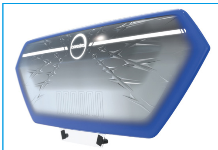
Frontend grille concept showcasing function and design integration through Film Insert Molding (FIM) technology – presented by Covestro at K'22 fair.

Sensors like RADAR, LiDAR, IR, or VIS cameras are vital for autonomous driving. Achieving high surface qualities, material purity, and component precision are crucial for ensuring the long-term functionality of these sensors. On the outer surfaces, scratch-resistant coatings are necessary to ensure that sensor signals can pass through the cover undisturbed, even after years of use.