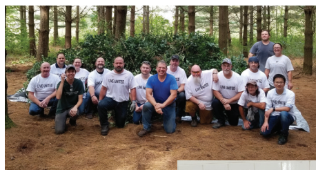
◀ Joining forces with United Way of Licking County to strengthen our community

Our passionate employees have countless opportunities to take their talents to the communities where we live, work and play, by helping non-profits solve business challenges, raising funds for a good cause, sharing our excitement for science with the next generation, and inspiring a cleaner future.