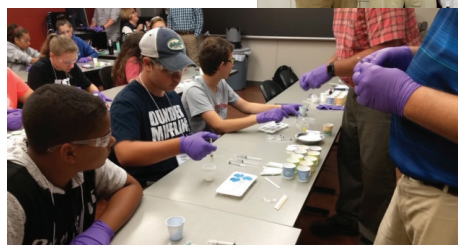
◀ Introducing students to manufacturing