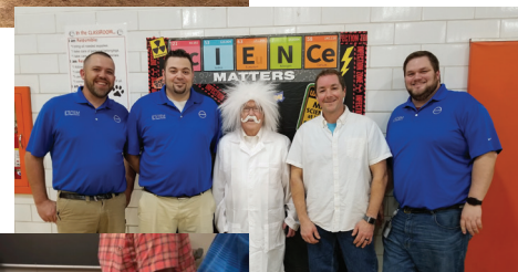
▶ Bringing hands-on science learning to the next generation