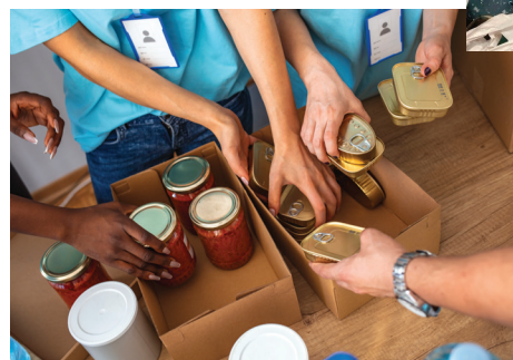
Working with local food bank to help those in need.