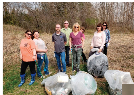
Organizing a Fox River Trail clean-up.