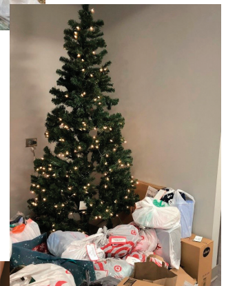
Working with the Elgin Crisis Center to support our community.